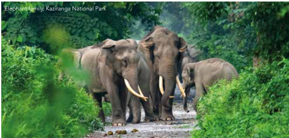
Elephant family, Kaziranga National Park