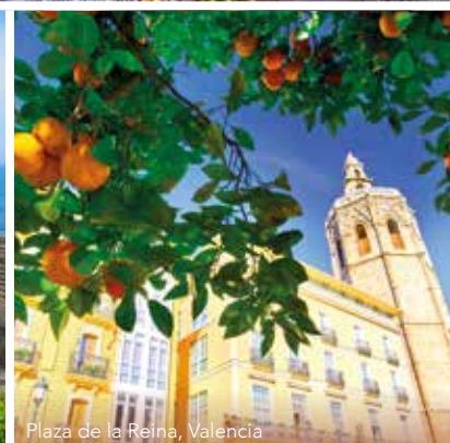
Plaza de la Reina, Valencia