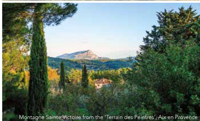
Montagne Sainte Victoire from the 'Terrain des Peintres', Aix en Provence

enjoy a few hours exploring the pretty harbour town of Mahon at your own pace before we sail in the early afternoon.