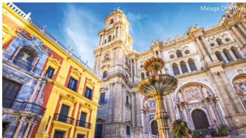
Malaga Old Town