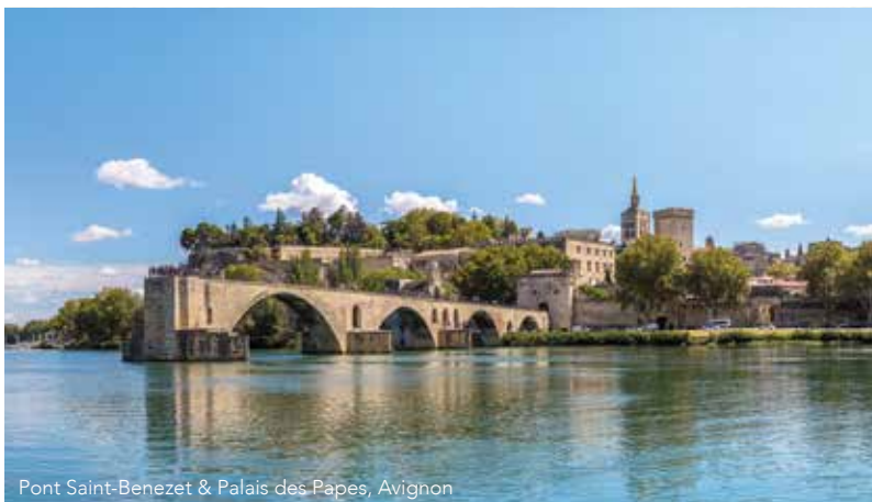
Pont Saint-Benezet & Palais des Papes, Avignon