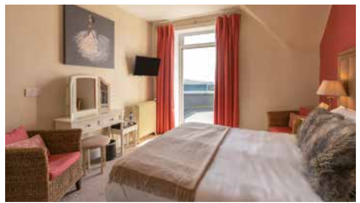
Main House – Sea View Room