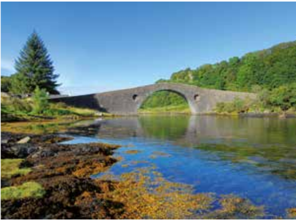
The Clachan Bridge (Atlantic Bridge), Isle of Seil