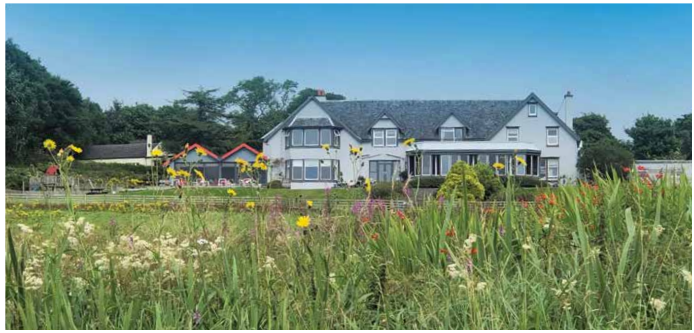
Exterior of Loch Melfort Hote