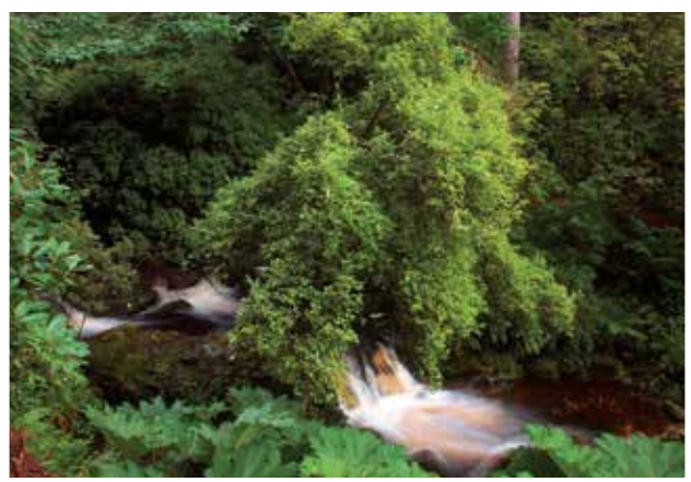
Crarae Gardens and the Crarae Burn