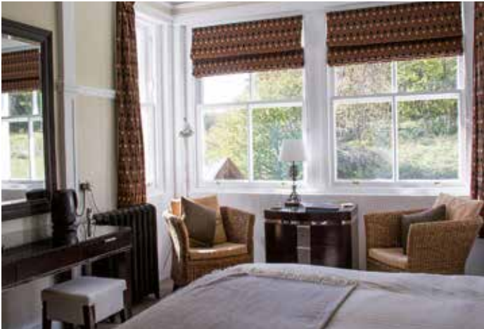
Main House - Garden View Room