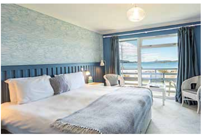
Sea View Lodge Double Roon