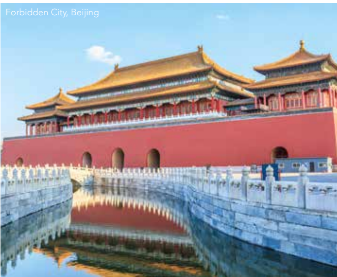
Forbidden City, Beijing