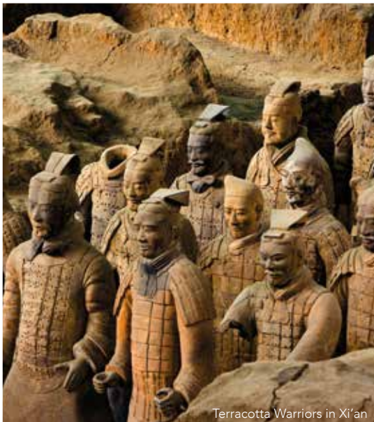
Terracotta Warriors in Xi'an

Day 5 Beijing. Board a rickshaw this morning for a tour along some of the city's narrow laneways. Local knowledge means we will see aspects of the historic Shichahai area that most travellers will never encounter. While here, we also pay a visit to a local family living in one of Shichahai's traditional homes. Our hosts guide us in a hands-on dumpling-making experience, before we all sit down to share a delicious meal. This authentic local experience also sees us learning the traditional Chinese folk arts of paper cutting and inside painting, as well as shuttlecock and yoyo. This afternoon, we meander through the park known as the Temple of Heaven. Gain a sense of local life here, appreciating the stark contrast of spiritual observance amid the buzzing activity. As we cast our gaze across the grounds, we may catch sight of people practicing tai chi, or otherwise engaged in singing or music. Soaring city views are enjoyed during this evening's dinner. The glass ceiling and walls of the 66th-floor China Grill are spectacularly styled in pyramid fashion, while its decorative trees and water features enhance the setting.