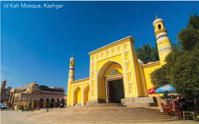
Id Kah Mosque, Kashgar

Day 11 Kashgar. Waking in Kashgar this morning means we have plenty of time to spend at the Sunday Grand Bazaar. Wander the aisles of this historic marketplace, where stalls stocked with spices, bread, and other delicacies reveal the culinary heritage of the region. As you browse the assorted wares on offer, you might also try to discern some of the many dialects spoken by traders and shoppers in this cultural melting pot. Enjoy the afternoon at leisure before we meet this evening for dinner at our hotel.