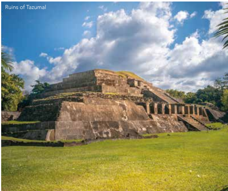
Ruins of Tazumal

Site. Built between three magnificent volcanoes in 1542, it is one of the oldest and most beautiful cities in the Americas. Antigua remained an economic and political heart of Central America until a devastating earthquake in 1773 destroyed much of the city. We will explore the city which is a wonder of colonial buildings, beautiful squares, cobblestone streets and Baroque churches. This afternoon we will transfer to our hotel for a two night stay and the remainder of the day will be at leisure for independent exploration before we meet for dinner tonight.