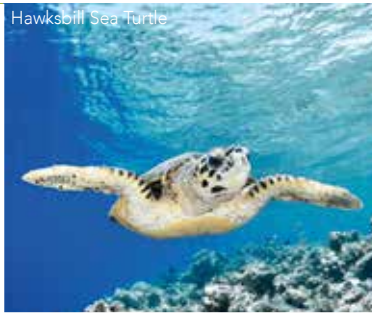
Hawksbill Sea Turtle