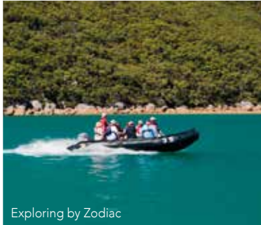
Exploring by Zodiac