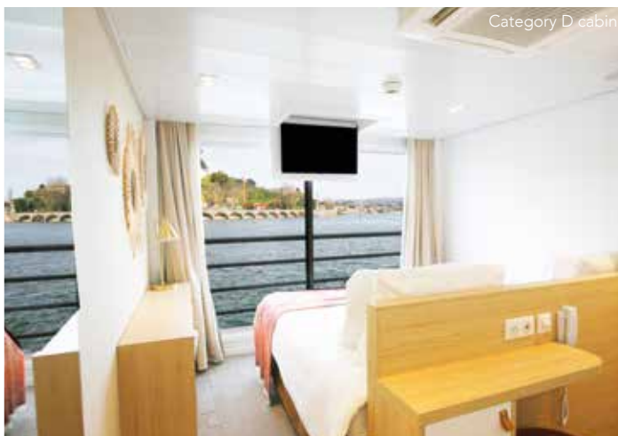
Category D cabin