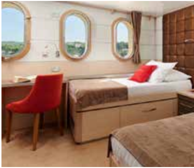
Cat 3 Twin Cabin