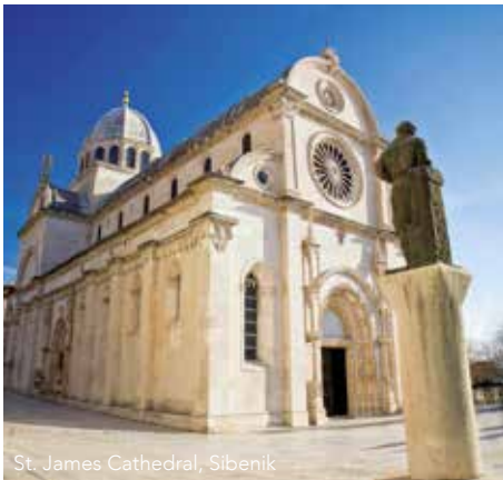
St. James Cathedral, Sibenik