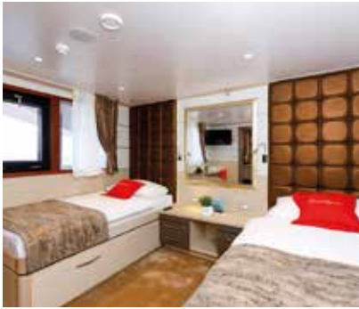
Cat 4 Twin Cabin