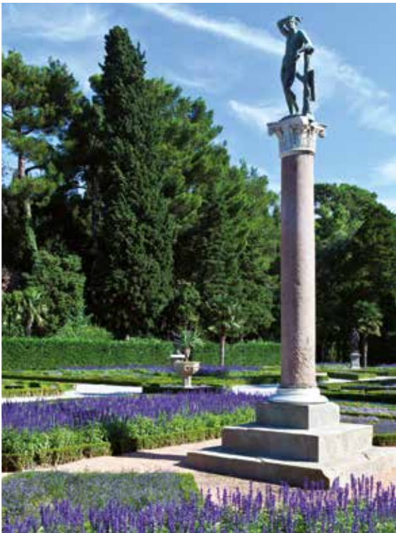
Miramare Castle gardens

Day 3 Muggia & Lipica, Slovenia. After breakfast we leave Trieste via water crossing the harbour to reach the pretty village of Muggia which, sitting at the northeasternmost tip of Italy, is the only Italian port town in Istria. The small town centre still shows traces of its Venetian traditions and origin as evident in the dialect, the gastronomic traditions, the Gothic-Venetian style of some houses, the narrow “calli” and the main square, a true Venetian “campiello”. We will stop for a seafood lunch in one of the town’s restaurants. After lunch, we will cross the border into Slovenia to Lipica, the village giving its name to the Lipizzan horse breed. We will visit the Lipica Stud Farm, one of the very first farms to develop the Lipizzan breed in the 16th century, for a guided tour and a show to learn more about their majestic horses. We return to our hotel in Trieste and the remainder of the day is at leisure. (B, L)