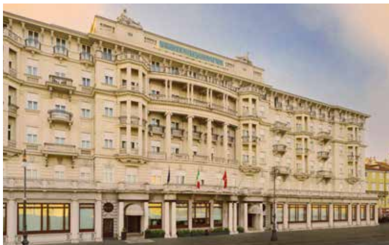
Savoia Excelsior Palace