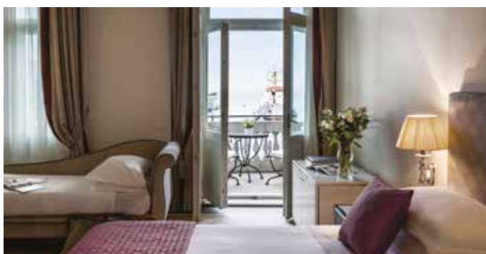
Deluxe Room with sea view and balcony

The Savoy restaurant offers a gourmet dining experience serving Italian cuisine including traditional local delicacies, accompanied not only by the finest wines but also by the splendid seafront views. For a cocktail, aperitif or digestif, the Le Rive bar is elegantly designed with views over the gulf. From the concierge to the 24-hour room service, from the modern gym to the tranquil library with lovely skylight, all the hotel's amenities and public spaces, combined with the excellent location, ensure a relaxing stay in a superb level of comfort.