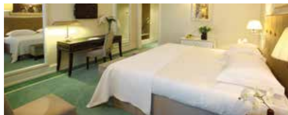
Superior Room with sea view