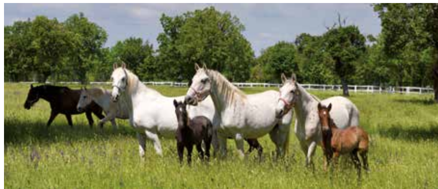
Lipica Stud Farm