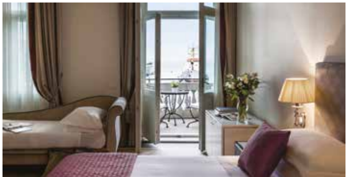
Deluxe Room with sea view and balcony

The Savoy restaurant offers a gourmet dining experience serving Italian cuisine including traditional local delicacies, accompanied not only by the finest wines but also by the splendid seafront views. For a cocktail, aperitif or digestif, the Le Rive bar is elegantly designed with views over the gulf. From the concierge to the 24-hour room service, from the modern gym to the tranquil library with lovely skylight, all the hotel’s amenities and public spaces, combined with the excellent location, ensure a relaxing stay in a superb level of comfort.