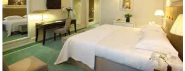
Superior Room with sea view