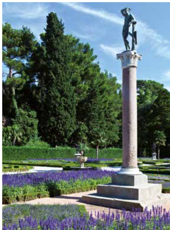
Miramare Castle gardens

Day 3 Muggia & Lipica, Slovenia. After breakfast we leave Trieste via water crossing the harbour to reach the pretty village of Muggia which, sitting at the northeasternmost tip of Italy, is the only Italian port town in Istria. The small town centre still shows traces of its Venetian traditions and origin as evident in the dialect, the gastronomic traditions, the Gothic-Venetian style of some houses, the narrow "calli" and the main square, a true Venetian "campiello". We will stop for a seafood lunch in one of the town's restaurants. After lunch, we will cross the border into Slovenia to Lipica, the village giving its name to the Lipizzan horse breed. We will visit the Lipica Stud Farm, one of the very first farms to develop the Lipizzan breed in the 16th century, for a guided tour and a show to learn more about their majestic horses. We return to our hotel in Trieste and the remainder of the day is at leisure. (B, L)