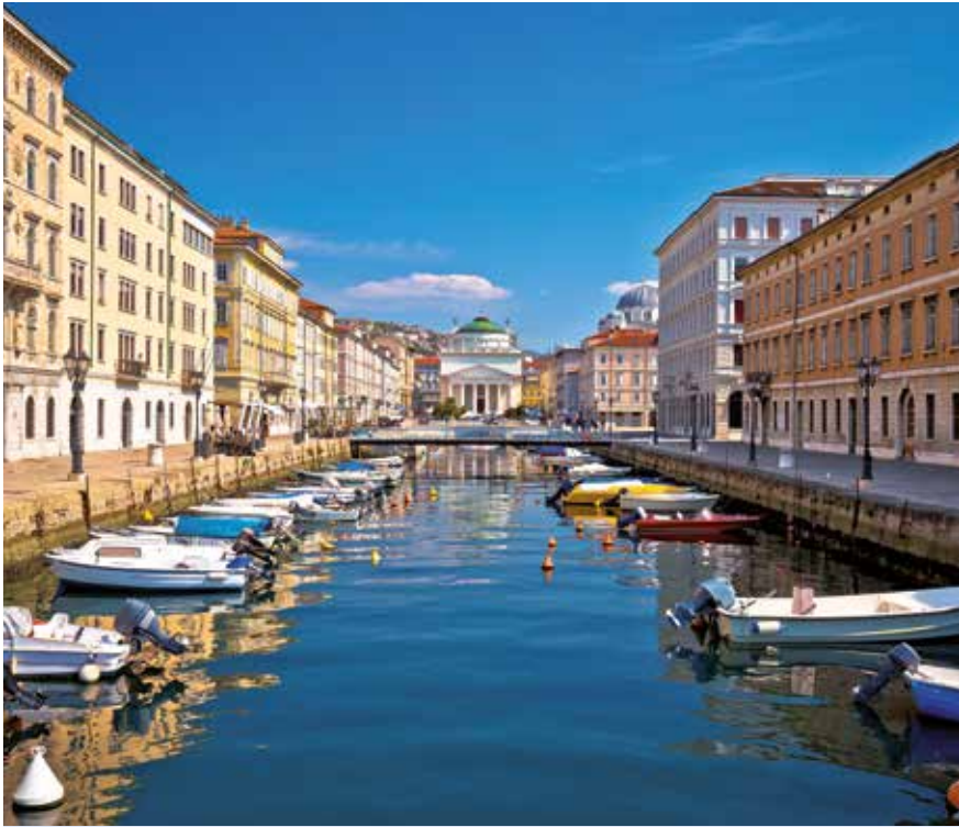
Canal Grande, Trieste