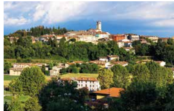
San Daniele del Friuli

Here is an opportunity to join a small group of fellow travellers for an exploration of one of Italy's least touristed regions. Tucked away in the far northeast of Italy, the autonomous Friuli-Venezia Giulia region is popular with neighbouring countries but is otherwise relatively unknown and far removed from mass tourism; yet this border region incorporates stunning scenery, a fascinating history, dramatic alpine landscapes, wonderful wine and cuisine along with an intriguing blend of Slovenian, Croatian, Austrian and Italian cultures. Upon discovering this unique region, strategically located at the crossroads of Central Europe, travellers fall under the charm of the unspoilt landscapes and warm welcome and find themselves returning time and time again.