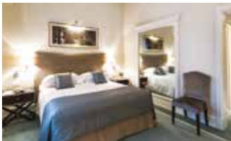
Classic Double Room for sole use