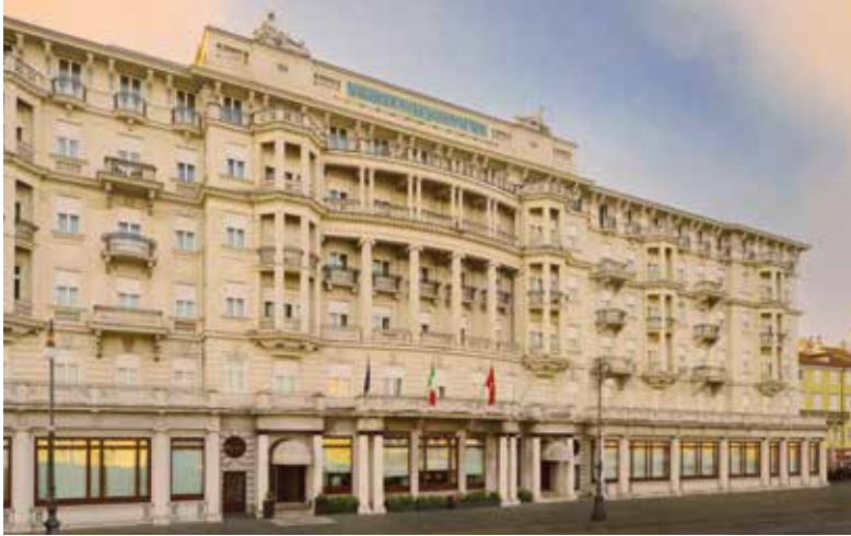
Savoia Excelsior Palace