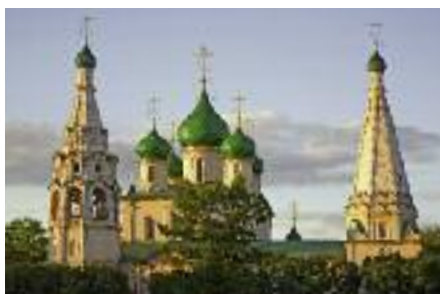
Church of Elijah the Prophet, Yaroslavl