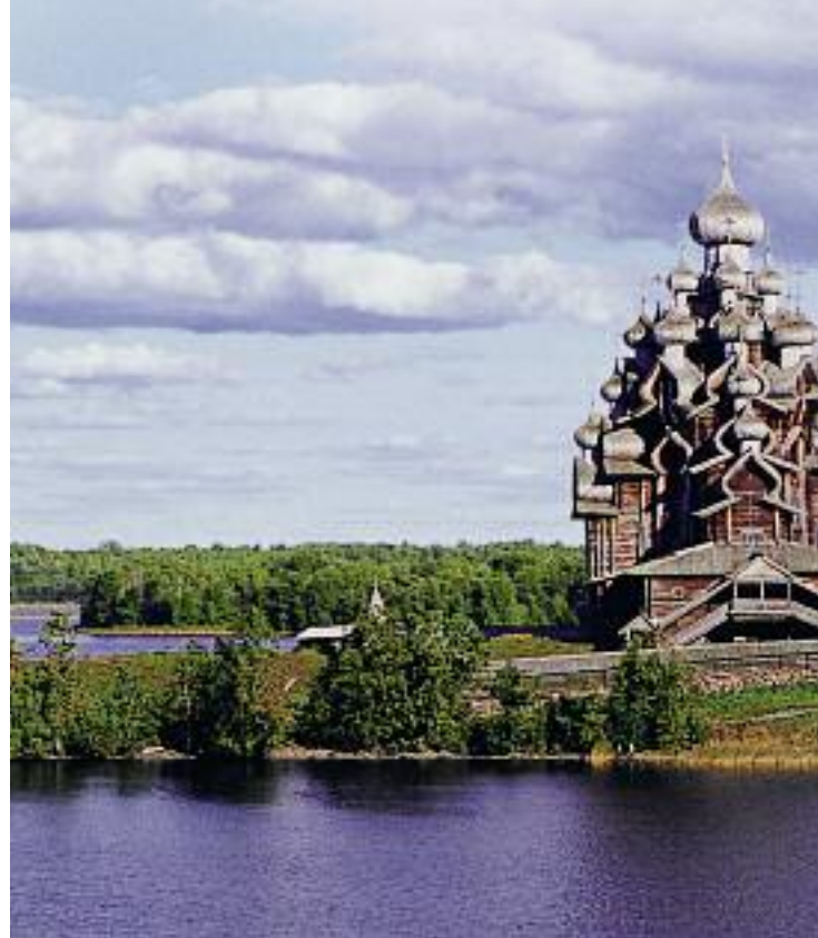
Church of the Transfiguration, Kizhi

Day 7 Uglich. Relax this morning as we cruise along the Volga, passing medieval villages a world away from modern Moscow. As we approach Uglich, you will see the cathedral and churches rise up from the horizon, and this has made Uglich one of the most beloved cities in Russia. It was here that Ivan the Terrible's son Dmitry was murdered in 1591, and the city built the magnificent Church of St-Dmitry-on-the-Blood on the spot where the murder took place. We will also visit the Cathedral of the Resurrection and view the outside of St John's Church.