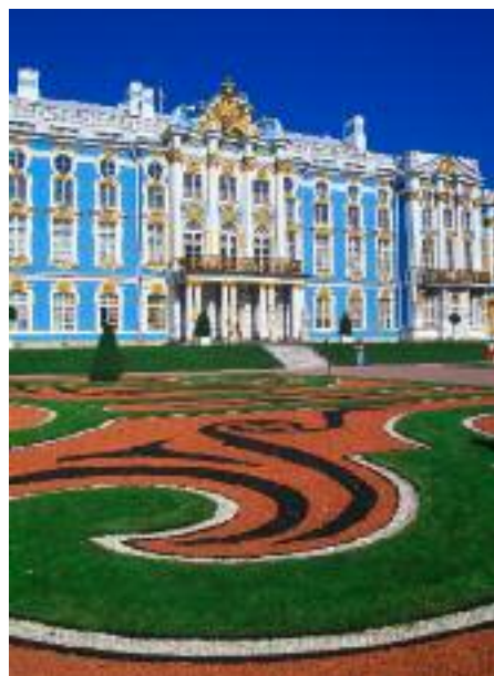
Catherine's Palace, St Petersburg

Day 15 St Petersburg to London Heathrow. Disembark and transfer to the airport for the return scheduled flight to London.