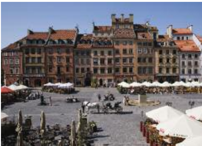
Old Town Square, Warsaw

Days 5 & 6 Moscow. Your stay in Moscow will begin with a morning's guided city tour which will include Red Square and St Basil's cathedral (outside only). In addition there will be another guided tour inside the Kremlin. With your free time, explore the Metro, perhaps visit the Tretyakov Gallery with its magnificent collection of Russian paintings.