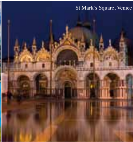
St Mark's Square, Venice