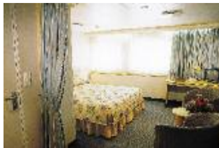
Category 5 Cabin

This cruise visits out of the way destinations. You will be accompanied by an expedition team and many landings ashore will be made by Zodiac landing craft. This cruise will appeal to the more adventurous and those who enjoy the natural world.