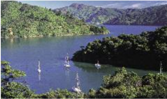
Bay of Islands

Day 13 Kaikoura. Kaikoura is a famous whale watching area due to its nutrient rich waters and is one of the only places in the world where you can easily see sperm whales. This morning enjoy a guided coastal walk and time at leisure or alternatively enjoy an optional whale watching cruise. Sail this afternoon.