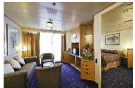
Category 7 Suite