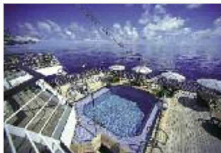
Lido deck Pool