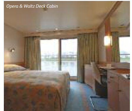
Opera & Waltz Deck Cabin

The air holidays and flights in this brochure are ATOL protected by the Civil Aviation Authority Our current booking conditions apply to all reservations (available on request)