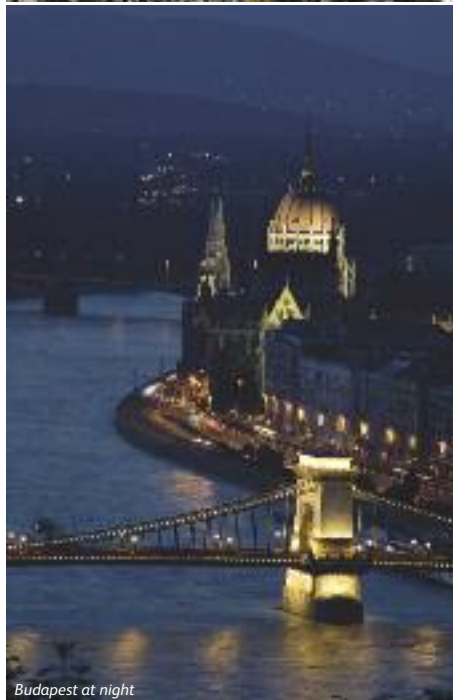
Budapest at night

BOOK BEFORE 28 OCTOBER 2011 AND SAVE £200 PER PERSON OFF THE PRICES SHOWN