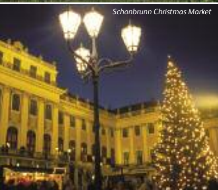
Schonbrunn Christmas Market

Christmas in Central Europe is a very special time and nowhere is this more evident than in the cities, towns and villages of the Danube. Our Christmas cruise has been planned to include the Christmas markets in Vienna and Salzburg, a 'Mozart tour' in Salzburg, and a day in the lovely Wachau Valley with a visit to the village of Weissenkirchen where the traditional joys of Christmas can be best enjoyed. For those who wish to attend Midnight Mass we have made arrangements for a visit to the magnificent church in Melk Abbey. Other highlights of the week will include a full day and two evenings in Budapest, a visit to the Hungarian palace of Godollo and a tour of the scenic Danube Bend and Hungary's second city of Esztergom.