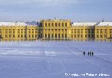
Schonbrunn Palace, Vienna