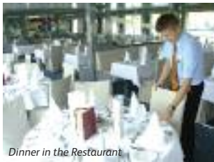
Dinner in the Restaurant