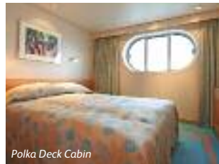
Polka Deck Cabin