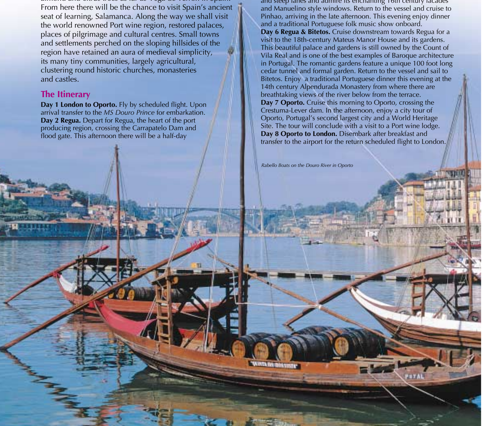
Rabello Boats on the Douro River in Oporto