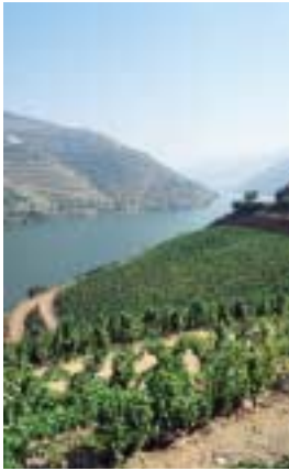
Vineyards of the Douro

The Douro Valley is a region of stunning natural beauty, a serene landscape of hillside vineyards lining the winding river banks of the River Douro. From its meager beginnings in the hills north of Madrid, the River Douro makes its way through Northern Portugal, descending almost 400 feet in a meandering flourish to the ocean and the endlessly fascinating city of Oporto.