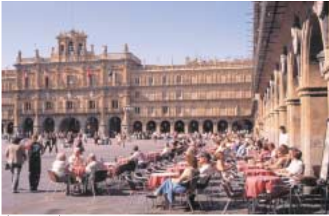
Plaza Mayor, Salamanca