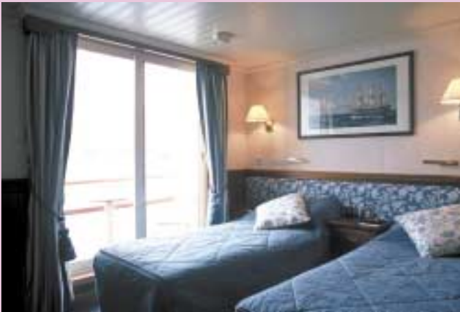
Category 2 cabin