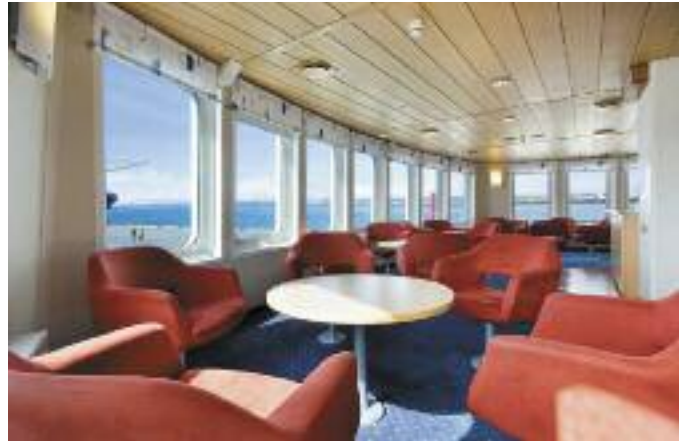
Ocean Nova library