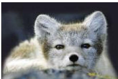
Arctic Fox (Mirelle De La Lez)