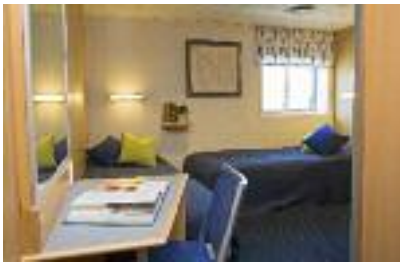
MS Quest Cat D cabin