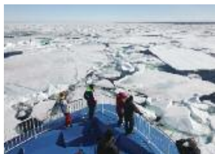
On deck (Adam Rheborg)