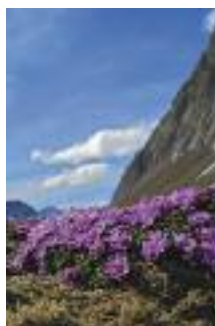
Wild flowers (Adam Rheborg)

Day 10 Longyearbyen to London. Disembark after breakfast and return to London by scheduled flight via Oslo.