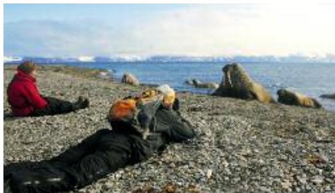
Walrus up-close (Vera Simonsson)

Eastern Svalbard: Venturing eastwards we skirt and possibly encounter the shifting Arctic Ocean pack ice. It is a harsh and seldom-experienced environment and one stands in awe at this majestic icescape. Chances of meeting polar bears increase as we sail along the ice floes. The island of Nordaustlandet is covered by an enormous ice cap and fascinates naturalists as well as historians.