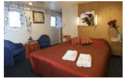
MS Quest Cat A cabin