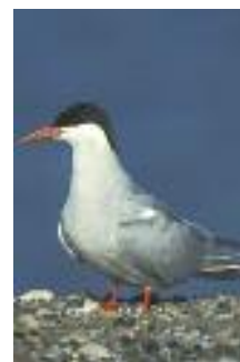
Arctic tern (Oscar Westerman)