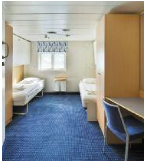
Ocean Nova Cat 3 cabin