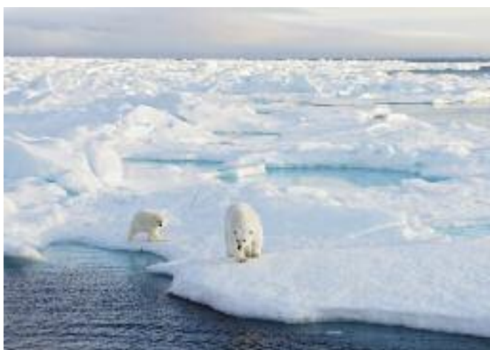
Polar bears (Adam Rheborg)

NB. Itinerary is for guidance only. The exact route will depend on ice and weather conditions and wildlife sightings.