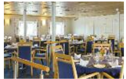
Ocean Nova restaurant

The Panorama lounge located on the top deck affords excellent views and is the main meeting place. It is here that the expedition team will provide informative and informal talks and briefings. The bar is also located in the lounge and both vessels have a small library. The attractive dining room seats all passengers in a single sitting and offers delicious meals with a mixture of table service and buffet. The Bridge is also open to passengers and here officers will provide chart and sailing information for all those interested in the vessels' navigation and operation. In addition there is a doctor onboard both vessels.