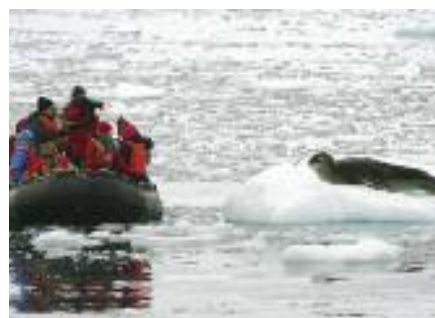
Exploring by Zodiac