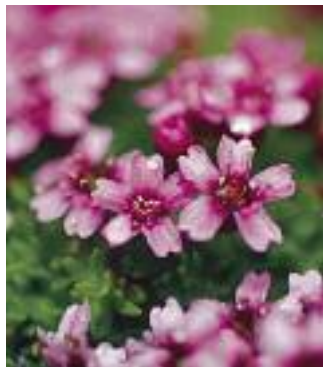
Wild flowers (Mirelle De La Lez)

NB. Itinerary is for guidance only. The exact route will depend on ice and weather conditions and wildlife sightings.